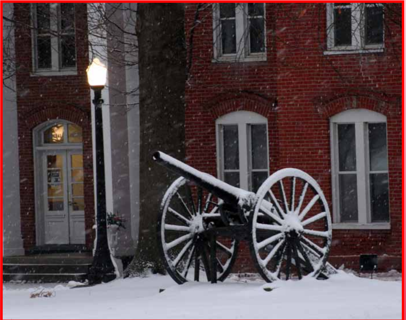
Snow On Campus, February 24, 2011

Published by the Wentworth Military Academy Alumni Association