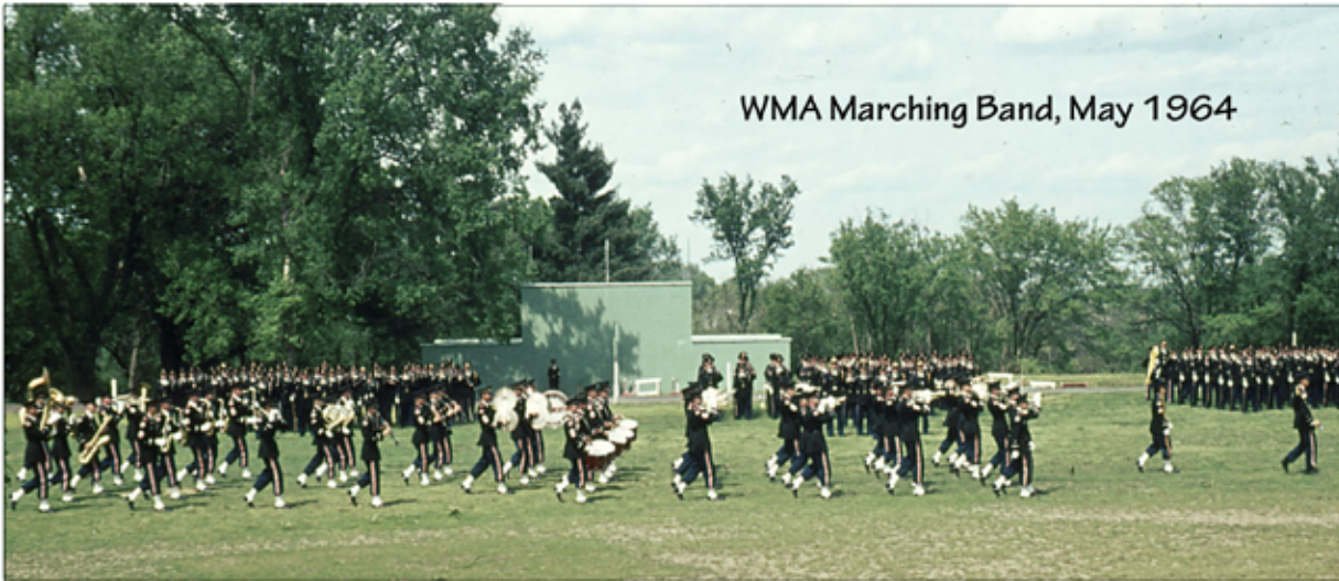
WMA Marching Band, May 1964