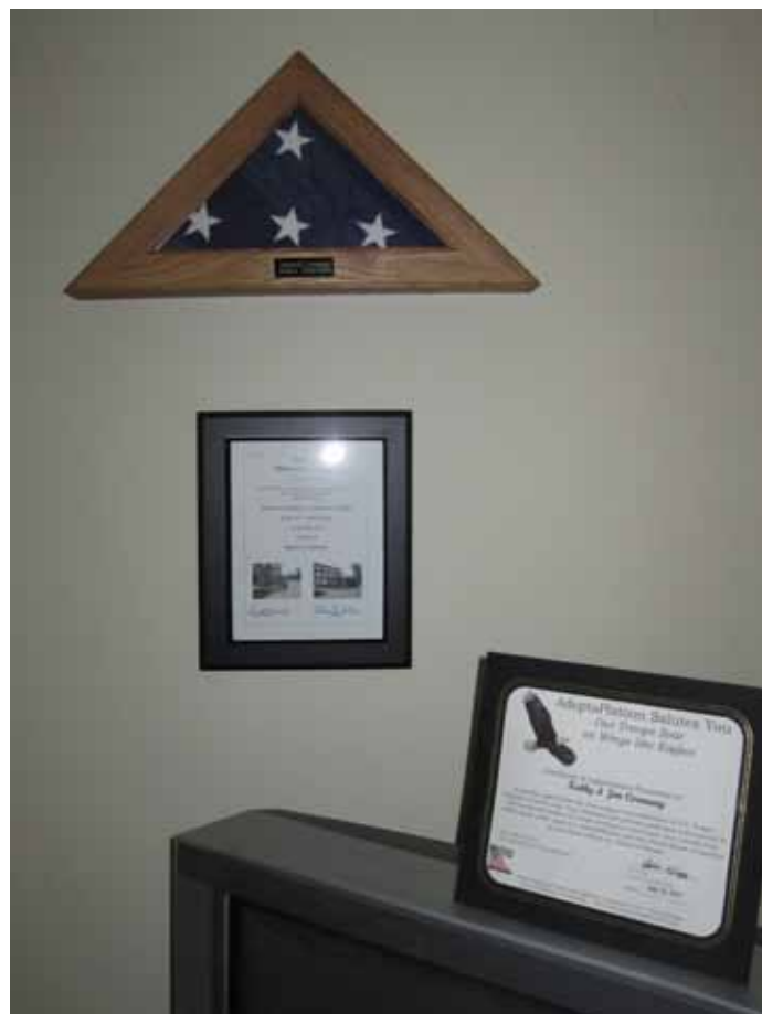
The Cormany Flag is Displayed