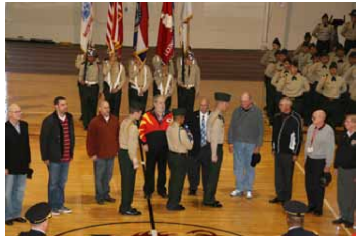
Some Previous Homecoming Pictures