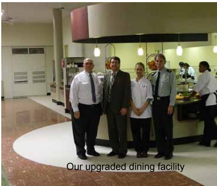
Our upgraded dining facility