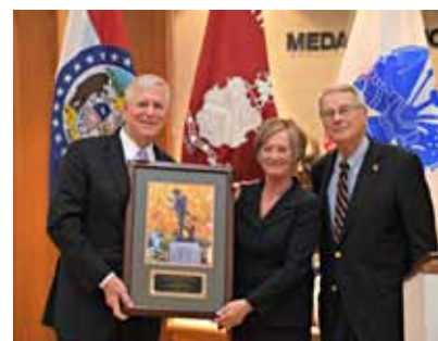
GEN Richard Myers - Awarded