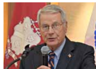
GEN Richard Myers The Keynote Speaker

Retired GEN Richard B Myers was the keynote speaker and made a point that Skelton's non-partisan leadership was crucial in galvanizing leaders on both sides of the aisle to work together to accomplish our nation's military goals. Meyers said that Skelton provided terrific support for our troops and always kept their needs at the top of his priority list. "There was no one more committed to America's defense or those who defend us than Ike," remarked Myers.