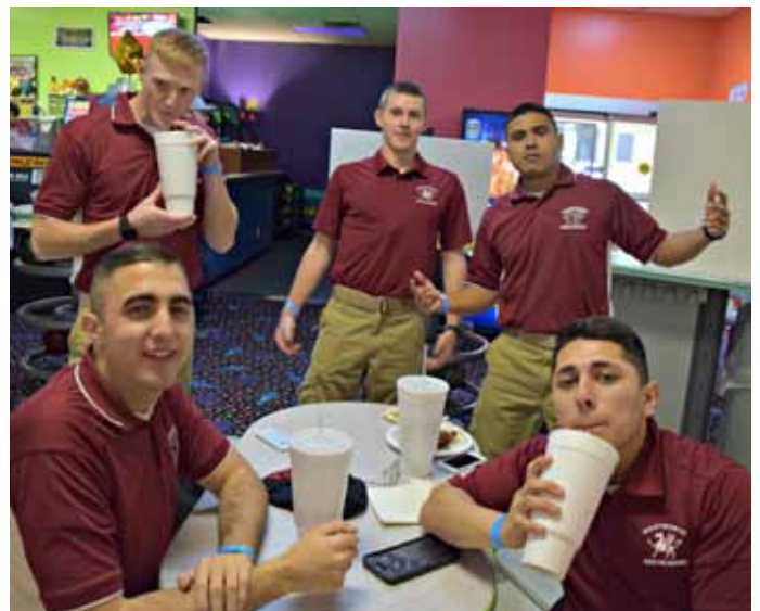
Above and below; a group of cadets went to the bowling tournament not only to have fun, but also support her family and friends in this annual celebration of her life. They also helped raise money for JROTC Scholarships.