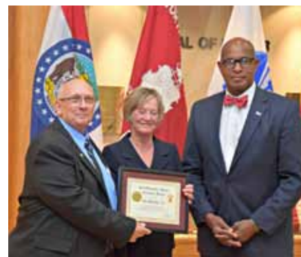
Wentworth Honor Graduate Award – Ike Skelton (posthumously)