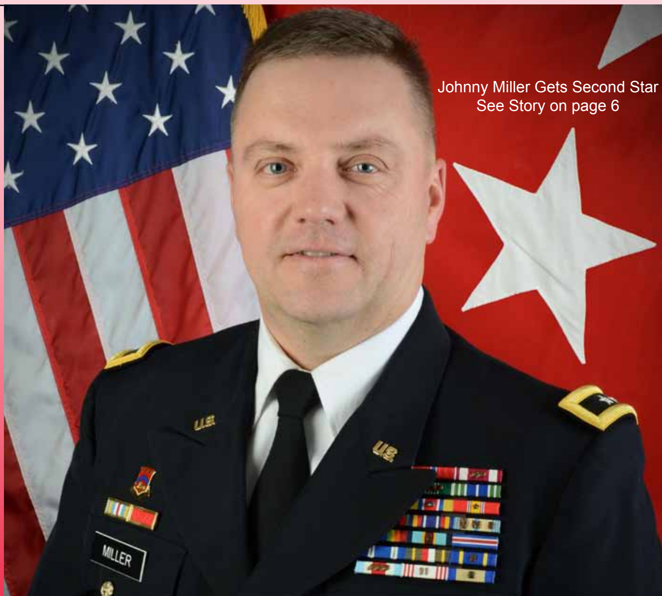
Johnny Miller Gets Second Star See Story on page 6

Published by the Wentworth Military Academy Alumni Association